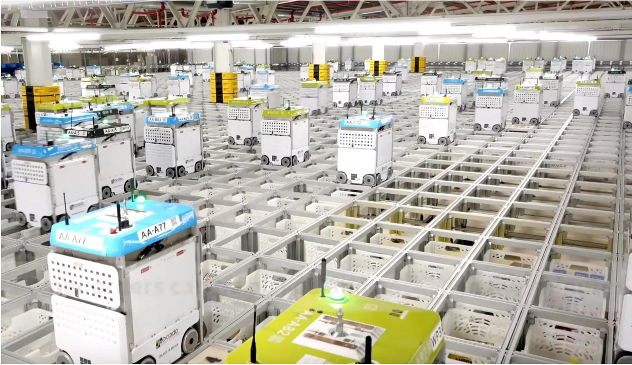
Ocado Group's cube storage system for e-grocery fulfillment

is the previously unheard-of speed at which some orders are now being picked and packed. Ocado's grid solution, for instance, is a state-of-the-art cube storage system for online grocery fulfillment that can put together an order of 50 items in just five minutes, 17 something that would take a human worker over 10 times longer. 18 The solution uses thousands of robots that travel over a grid system, picking and packing grocery orders, and is being implemented by multiple grocery chains across the globe, including