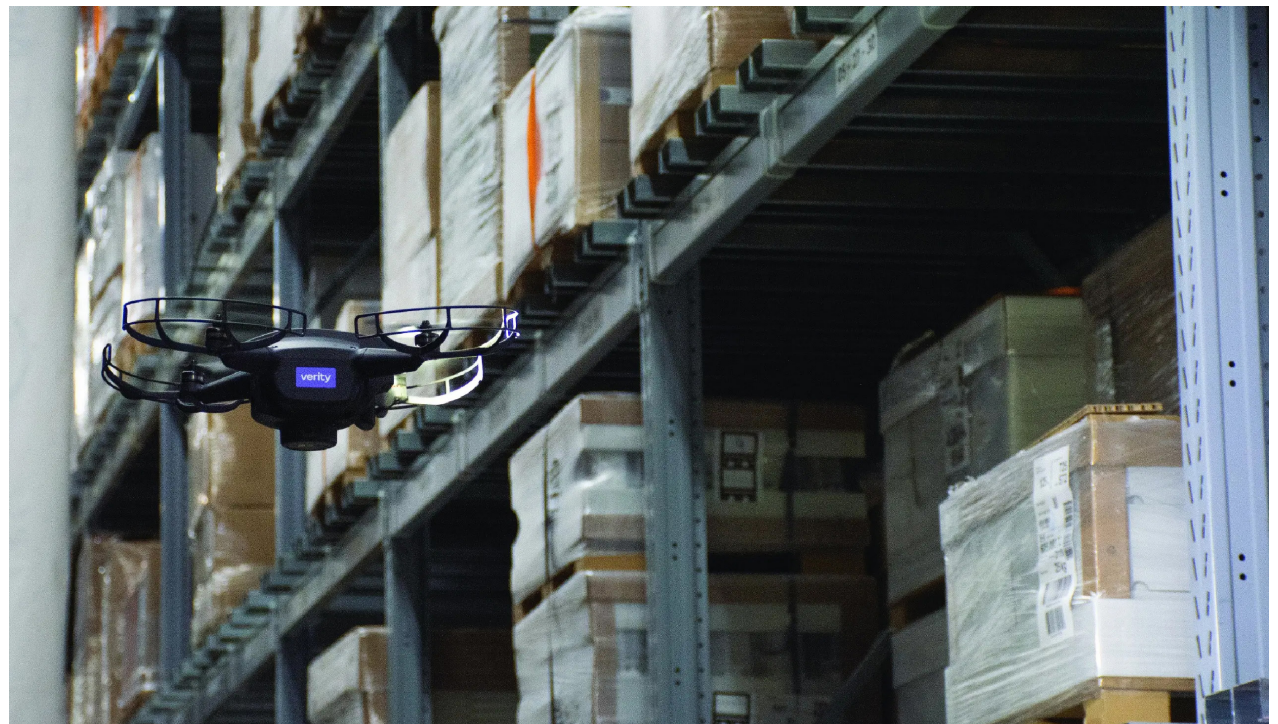
Maersk has retrofitted its legacy warehouses with new technologies like Verity inventory drones to minimize manual, physically taxing tasks, reducing the risk of worker injury.

Fulfillment speed was another factor that roundtable participants considered critical, as e-commerce requires short lead times. Warehouses are under immense pressure to deliver orders quickly and efficiently, and automation is a pivotal tool to help expedite the order fulfillment process and thus enhance customer satisfaction. Order fulfillment automation is nothing new; what is new