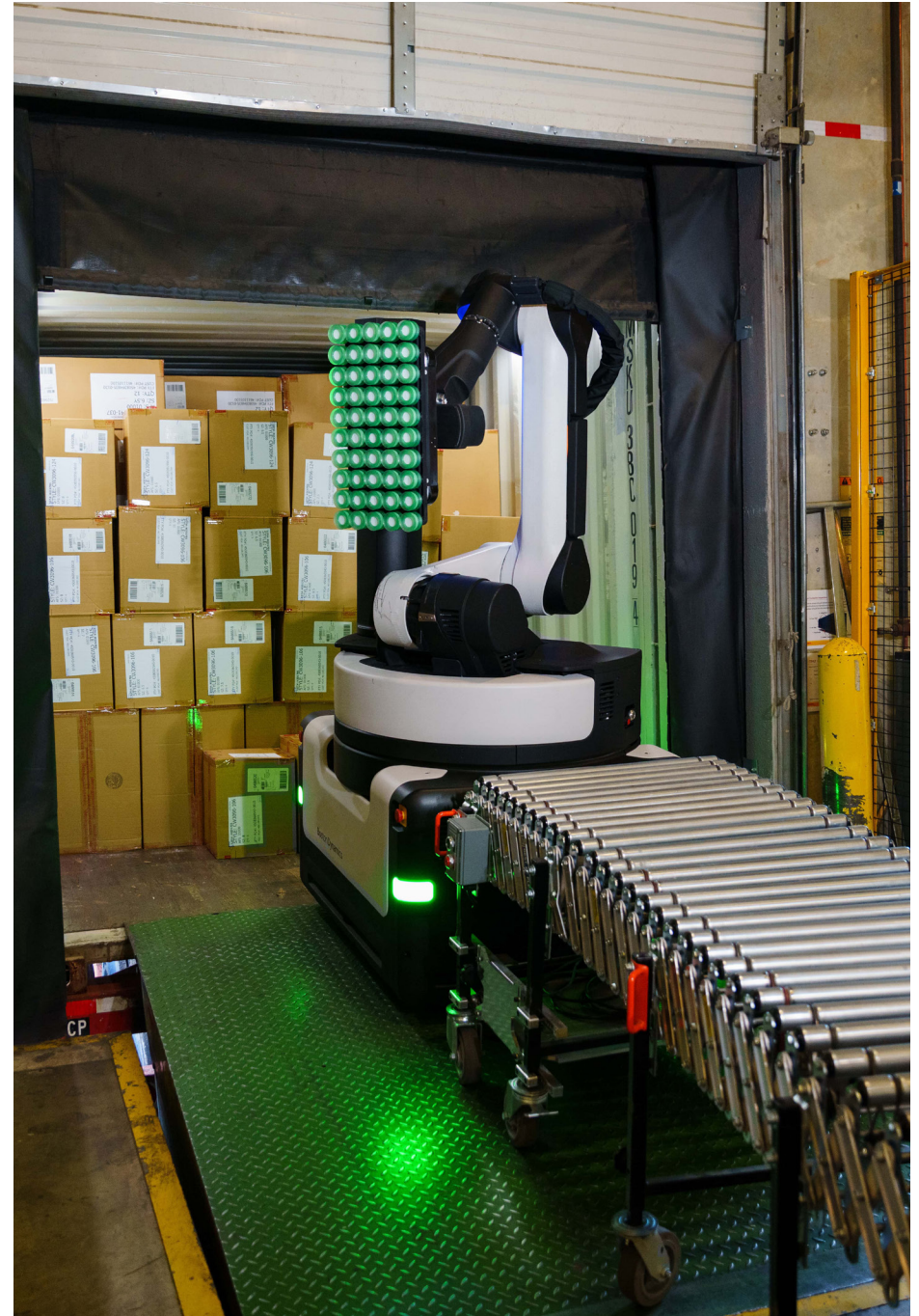
Boston Dynamics's Stretch robot can automate warehousing tasks.

Automation has emerged as a transformative force in the warehousing industry, revolutionizing operations and redefining the way goods are handled, stored, and distributed. With advancements in technology and the growing need for greater efficiency and productivity, warehouses are increasingly adopting automation solutions across all processes. One of the key reasons is that automation can relieve human workers from performing warehouse tasks that, historically, were physically demanding and monotonous. Examples include the use of advanced robots, like those from Amazon 11 or Locus Robotics, 12 that automate product movement across the warehouse, or the new technology for truck unloading developed by Boston Dynamics. 13 Both solutions minimize physically demanding