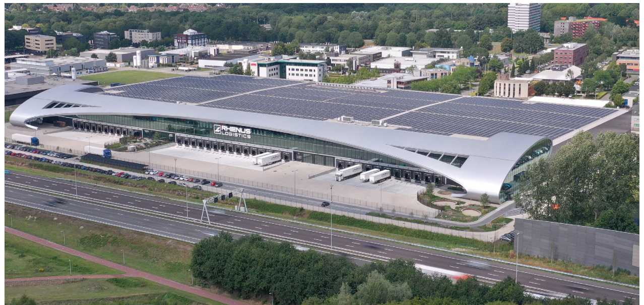
Rhenus Logistics warehouse in Tilburg, Netherlands, fitted with its own renewable power generator