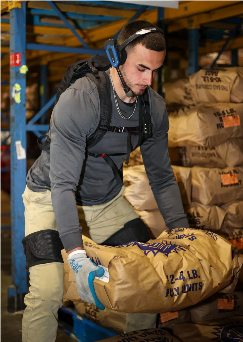
Verve Motion's SafeLift exosuit

grid solution is a perfect example of this, with thousands of collaborative robots (“cobots”) generating around 5,000 data points 1,000 times per second in a single warehouse. 23 The cobots, which are controlled by an advanced artificial intelligence (AI) system running in the cloud, communicate 10 times a second with this AI system to coordinate their movements.