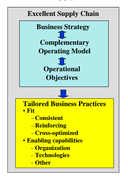
Figure 1: Excellent Supply Chain Framework

Specifically, strategy, operating models and operational objectives are interrelated and mutually supportive. The tailored set of business practices, a subset of all possible business practices, are chosen to reinforce each other and for their ability to support the strategy, operating model, and objectives of the organization. The use of the term "tailored practices," rather than "best practices," reflects the alignment of the practices to holistically fit the context of the organization. This interrelationship is explored in Michael Porter's article "What is Strategy?" in the November-December 1996 Harvard Business Review .