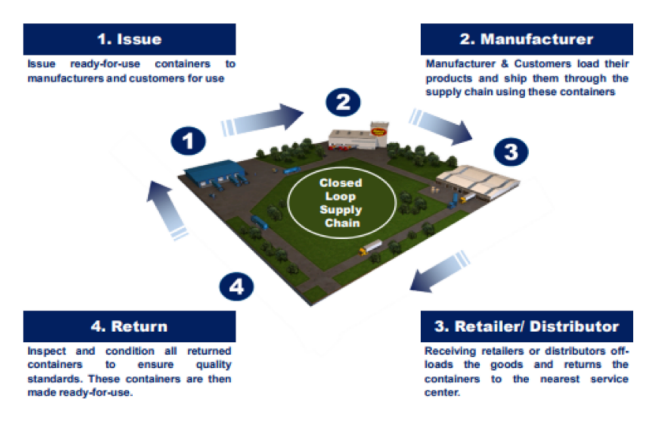
Figure 1: Illustration of the sponsor company's closed-loop supply chain

They issue ready-to-use empty RTIs to its customers. As seen in the flow of Figure 1, the customers load their products onto these RTIs and ship them through their supply chain. The RTIs are then emptied and offloaded, and returned to the sponsor company, typically to the nearest service center. At the service center, the sponsor company inspects all returned RTIs and separates RTIs which need repair. Damaged RTIs are cleaned, repaired and certified for use before being shipped out again.